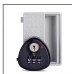
Combination Lock N6-3S