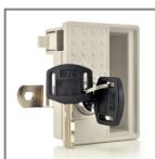
Key lock K1-W