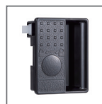
Handle H1-S (Black)