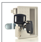
Key lock K2-W