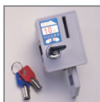
Coin Return Lock R1-S