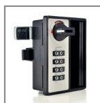
Combination Lock N9-4S-3