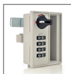
Combination Lock N9-4S-2