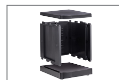
Internal Flattening Design