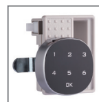
Electronic Numeric Lock EL-001