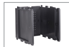
Dark Grey Body