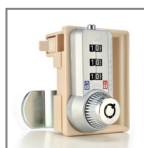
Combination Lock N8-3A